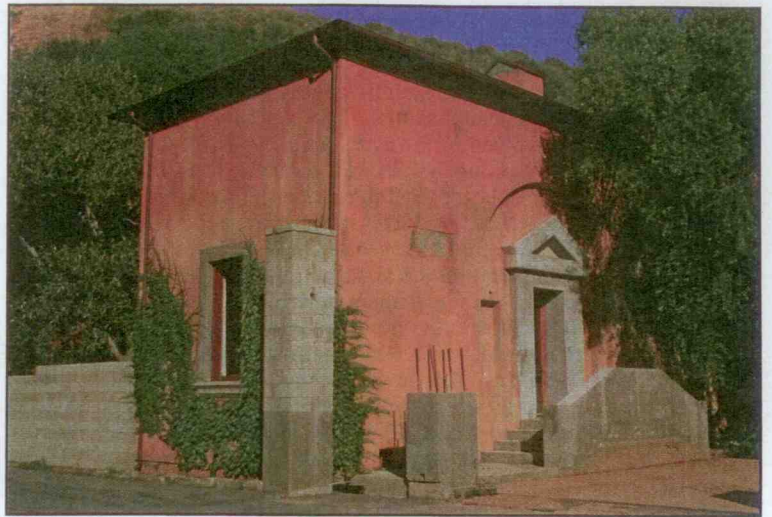
The Pinkham residence today.